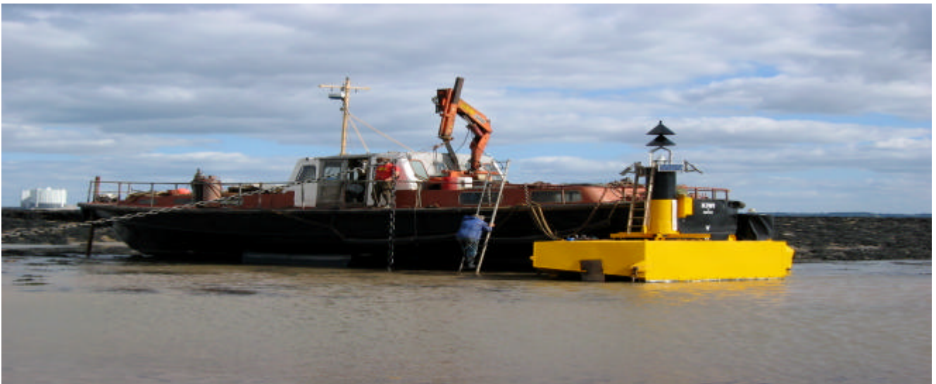
Buoy maintenance works, River Severn

The Trustees remain members of the British Ports Association and regularly participate in meetings of the South West Regional Ports Association and contribute to ASERA (Association of Severn Estuary Relevant Authorities) consultations.