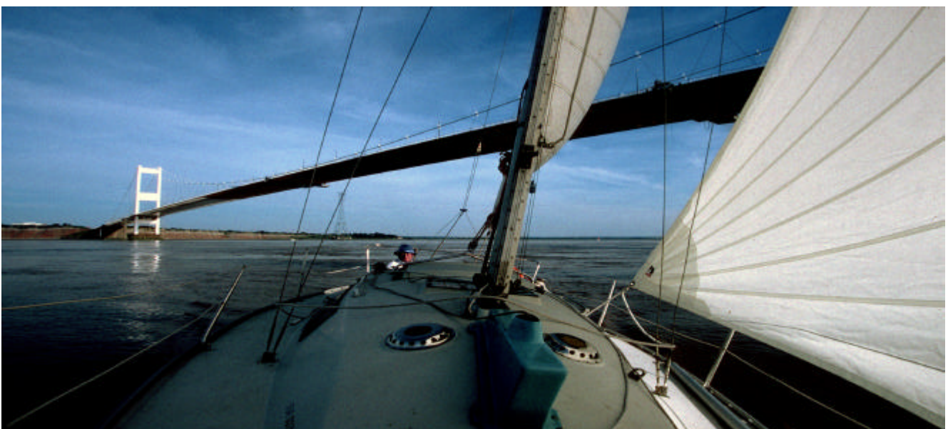
Sailing under the Severn Bridge