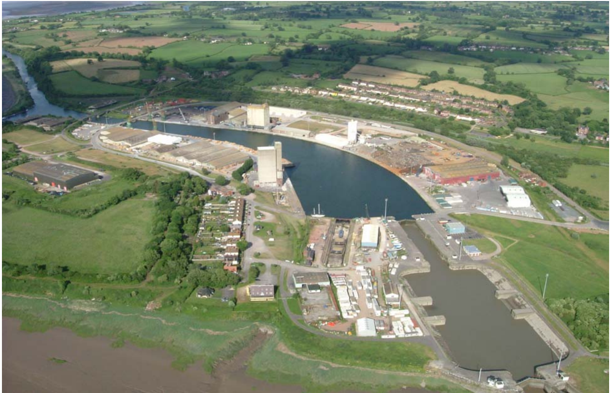
Two Views of the Dock at Sharpness